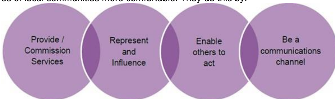
Source: Independent Review Panel on Community and Town Councils in Wales (2018)

Community and town councils have a number of basic responsibilities in making the lives of local communities more comfortable. They do this by: